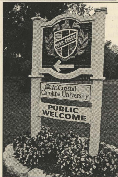
The new sign at Quail Creek at Coastal Carolina University beckons players.