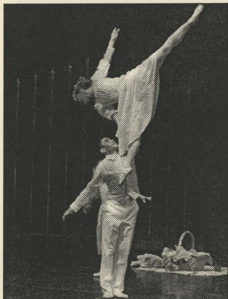
Dracula: Ballet with a Bite opens Nov. 4 and 5 at Wheelwright Auditorium.

with leading musical organizations throughout the U.S., including performances with the Mormon Tabernacle Choir. Edwards Recital Hall, free