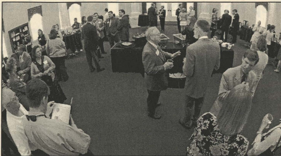
Scholarship reception: Coastal has more than 60 endowed scholarships that are awarded to approximately 160 students each year. A first-ever reception was sponsored recently by the Office of University Advancement in the Welcome Center in University Hall; it was designed to give scholarship recipients the opportunity to meet with scholarship donors.