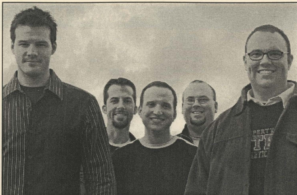
Christian rock bands Big Daddy Weave , shown above, and Overflow will perform on Friday, April 29 at Brooks Stadium. Tickets for CCU students are $5 at Wheelwright Box Office.