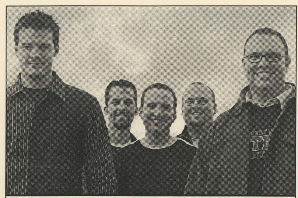
Christian rock band Big Daddy Weave will perform on Friday, April 29 at Brooks Stadium. Tickets for CCU students are $5 at Wheelwright Box Office.

Baseball vs. Liberty, 1 p.m., Charles Watson Stadium-Vrooman Field