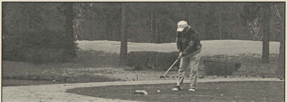
Coastal has entered into a five-year lease of the Quail Creek Golf Course for CCU's Professional Golf Management program. Below, a PGM student practices his swing.