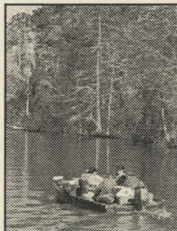
Hauling books to Sandy Island