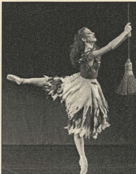
"Cinderella" is being presented by the Columbia City Ballet on March 31 and April 1.

March 31-April 1: "Cinderella" performed by the Columbia City