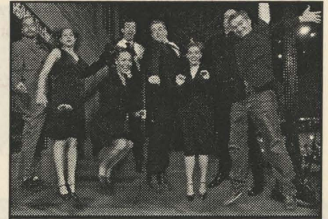
Cast members of Second City jump for joy in anticipation of their Jan. 14 show at CCU.

Founded in 1959, The Second City is recognized for its unique style of improv-based comedy and as the premier training ground for some of the world's most talented comedic performers. Second City alumni include Mike Myers, Dan Aykroyd, Bill Murray, Martin Short, John Candy, Chris Farley, Gilda Radner, Alan Alda, Joan Rivers, Julia Louis-Dreyfus and many others.