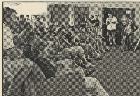
The Chanticleer baseball team gathers to watch the televised announcement of seeding that determined who and where they would play in the NCAA championship playoffs.