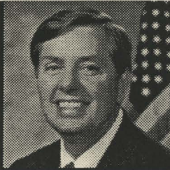
Lindsey O. Graham Commencement Speaker