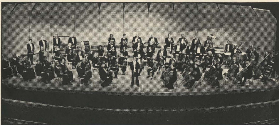
The Long Bay Symphony is joined by area choirs and renowned soloists for this annual rendition of Handel's "The Messiah," which will be performed at 4 p.m. on Sunday, Dec. 14 at Wheelwright Auditorium. Admission is $20 adults, $15 seniors, $5 students and free with a CCU ID.