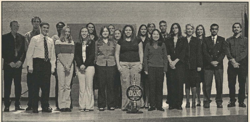
Twenty-one Coastal students were recently inducted into the local chapter of Omicron Delta Kappa, a national honor society that recognizes achievement in scholarship, athletics, campus or community service, mass media, and the creative and performing arts.