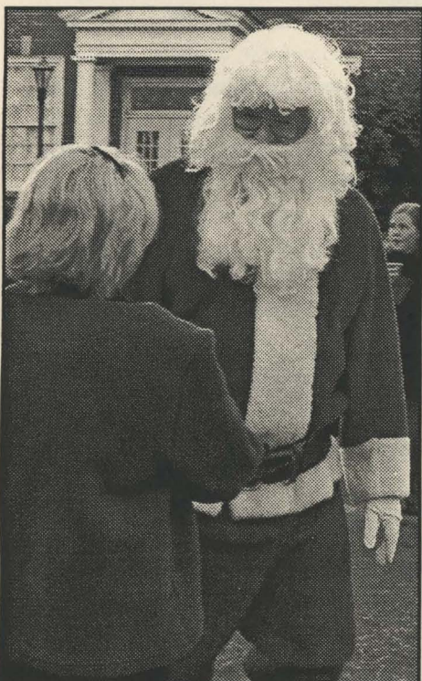
Santa works the crowd at the Coastal tree lighting on Tuesday, Dec. 2. Can you guess who donned the suit?

Time Warner Cable • Channel 17 Sundays at 7:30 p.m. & Wednesdays at 4 p.m. (South Strand)