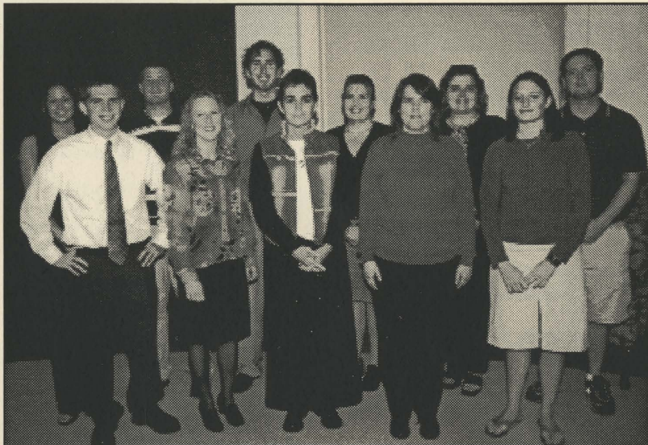
Some of the new inductees in Coastal's chapter of Phi Alpha Theta, the national history honor society, pose for a picture after the induction ceremony.