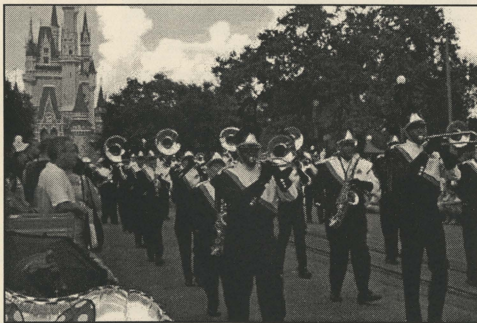
The Spirit of the Chanticleer Marching Band performs at Disney World in Orlando, Fla., on Sept. 19. From there, the band went on to cheer on the football team in Jacksonville.

Association of Certified Public Accountants. He will be formally recognized during the organization's annual awards dinner Nov. 13 in Columbia.