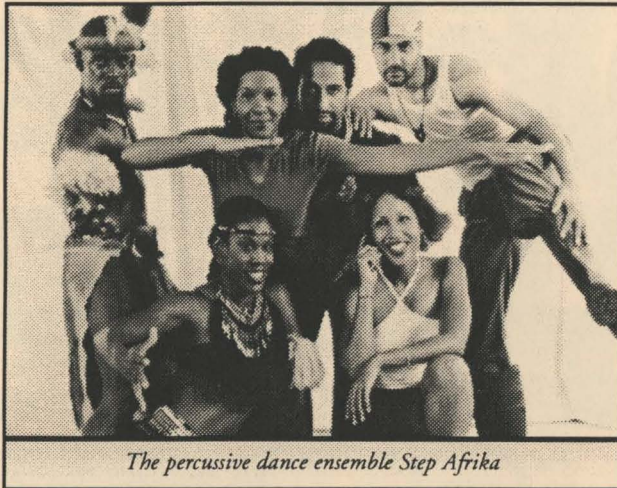
The percussive dance ensemble Step Afrika

Using the dance as a foundation, the Soweto Dance Theatre organized the Step Afrika! International Cultural Festival in Johannesburg and invited American students to join African students in a series of workshops and discussions on cultural development