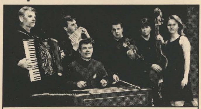
Harmonia, an eastern European folk music ensemble, will perform at Coastal on Friday, April 12 at 7:30 p.m.

trained virtuoso – come from various parts of eastern Europe and are drawn together by their love for their native music. Harmonia's musicians have played at Carnegie Hall, the Smithsonian