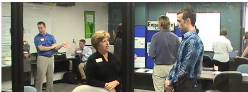
COOL and CeTEAL staff discuss teaching techniques and technologies with faculty at CeTEAL's Teaching & Technology