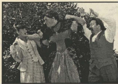
Cloud 9 will be presented in the Edwards Theater Feb. 27 to March 3.

Cloud 9 , a provocative and amusing study of sexual politics, will be presented by Coastal Carolina University Theater as part of the university's 2001-2002 Cultural Arts Series. Performances are