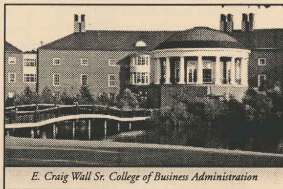
E. Craig Wall Sr. College of Business Administration

The grant will be used to develop joint dual degree programs in international tourism management and international business with internationally recognized European institutions; improve applied foreign language development materials for business students; develop short-term exchanges, summer study, and internship programs that provide opportunities for cultural enrichment for Coastal business students as well as for students from participating international institutions; and provide outreach activities to assist local businesses in attracting and serving international visitors.