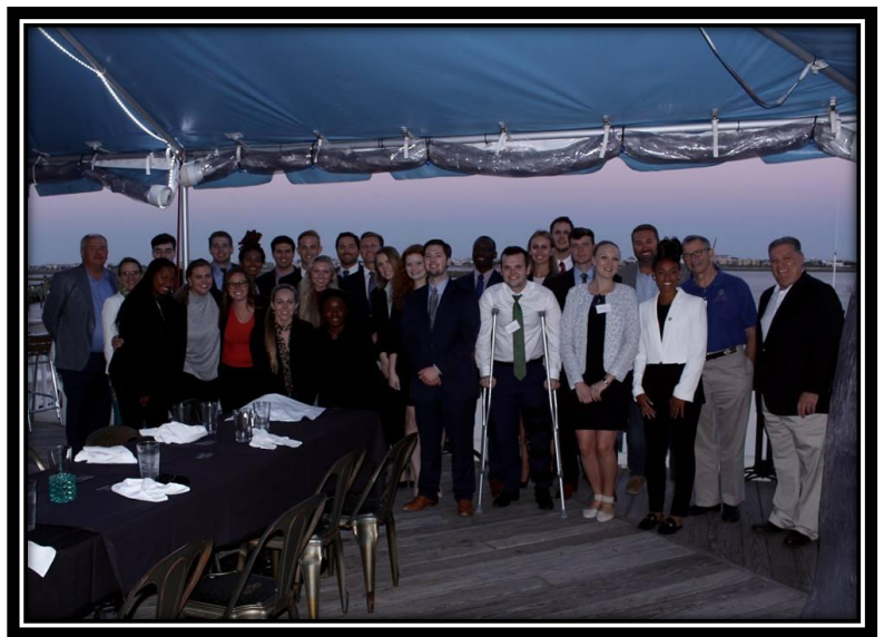
Wall Fellows during Spring Leadership Training.