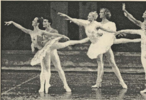
Nutcracker will be performed in Wheelwright Auditorium Saturday, Dec. 2 at 7:30 p.m.

Columbia City Ballet's production of Nutcracker will be performed in Coastal's Wheelwright Auditorium on Saturday, Dec. 2, at 7:30 p.m., as part of Coastal's 2000-2001 Cultural Arts Series. Tickets are $10; $5 for students.