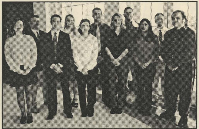
New members of Phi Alpha Theta were formally inducted into the national history honor society on Oct. 19 in the Wall Board Room.

The keynote speaker for the induction ceremony was David Hackett Fischer, who is Warren Professor of History at Brandeis University and a distinguished historian.