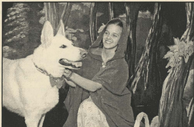
Coastal Carolina University Theater will perform Into the Woods Nov. 10 to 12 in Wheelwright Auditorium.

Coastal Carolina University Theater will present Into the Woods , a fractured fairy tale musical by Stephen Sondheim and James Lapine, on Friday, Nov. 10 and Saturday, Nov. 11 at 7:30 p.m.; and on Sunday, Nov. 12 at 3 p.m. in Coastal's Wheelwright Auditorium. Tickets are $10; $5 for students under age 18. Coastal students, faculty and