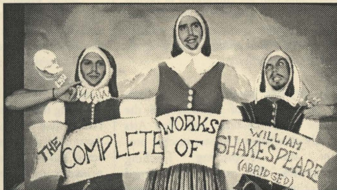
Coastal Carolina University Theater presents "The Complete Works of William Shakespeare (abridged)" Sept. 29, 30 and Oct. 1 at Wheelwright Auditorium.

For more information, contact the Wheelwright Box Office at 349-2502.