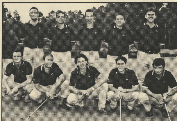
Ten students from the Autonomous University in Barcelona, Spain, are on campus to study in Coastal's Professional Golf Management program.