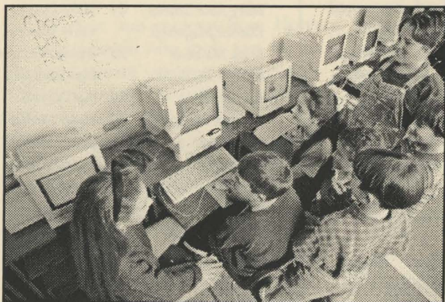
Computer courses are among the many classes being offered as part of the SuperSonic Summer Youth Programs.