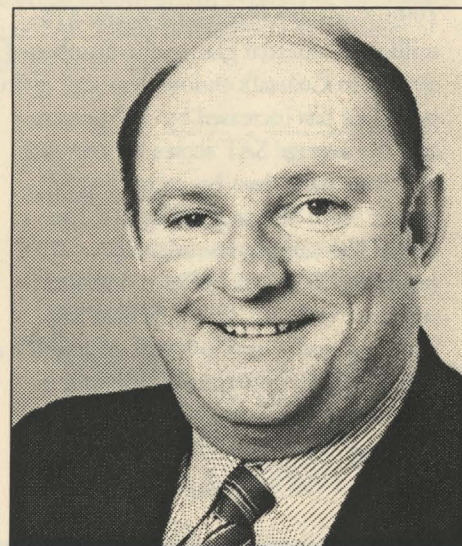
Marlin Fitzwater, former press secretary to presidents Ronald Reagan and George Bush

For more information, contact Coastal's Office of Marketing Communications at extension 2015.